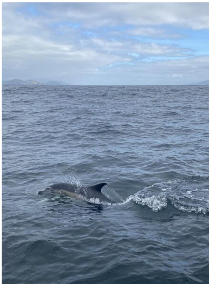
Dingle sea safari

This family-run business has become a social media star of late, sharing epic scenery and wildlife reels captured along the coast of the Dingle Peninsula. I embarked on the outfit's exhilarating tour, skirting from the inlets and sea caves of the spectacular Sleah Head out to the iconic Blasket Islands. Local Skipper Colm offers insights on everything from geology to ecology, highlights being Ireland's largest grey seal colony lolling around on Great Blasket. This is Dingle of course, so on the back leg, a pod of dolphins dipping offer the ultimate crescendo. Tours run up to November and cost €65pp