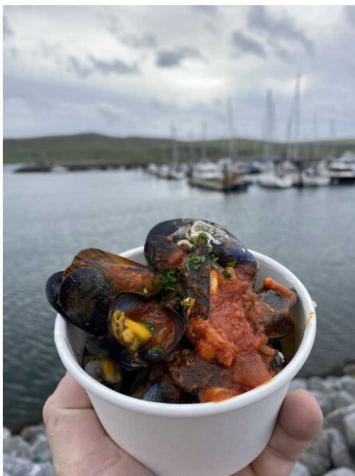
Mussels at Dingle food fest

This time of year makes a wonderful time of year to visit Dingle. The town is calmer but businesses, 96% family-owned, are so inventive here. Dingle was traditionally a town so dependent on fishing but now tourists can experience so much from sea safaris to seaweed baths. And everyone works together here in Dingle from the hotel and restaurants to the pubs and the activity providers.