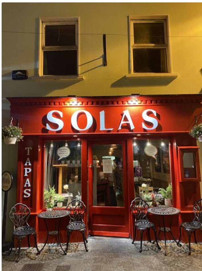
Solas Tapas in Dingle

Dingle has a Kinsale-of-Kerry vibe nowadays with its serious clutch of top restaurants per head of capita. I dined at Chef Nicky Foley's Solas Tapas, a gorgeous restaurant along the kaleidoscopic streetscape of Strand Street where I tucked into oysters with seaweed and olives, scallops ceviche, spuds bravas, octopus carpaccio and the most delicious orange and buckthorn sorbet. The next night, I headed to Fish Box, a seafood lovers' Shangri La which serving gourmet chipper fare, fresh off the Flannery's family trawler. I enjoyed the most delicious gluten-free battered calamari (a novelty as a coeliac), served zesty greens followed by chilli monkfish and rice (and perfect chips) washed down by a glass of Sauvignon Blanc. Both spots are must visits in Dingle with many more besides to relish; you can see why Americans on my safari tour were raving about the Dingle food.