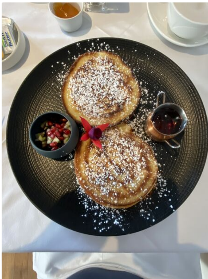
Breakfast at Castlewood House