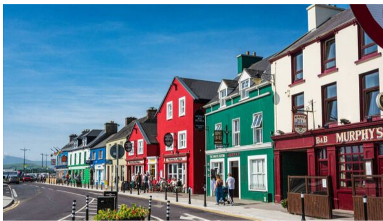
Dingle, Ireland, Europe - September 6, 2021 : Street in downtown Dingle

Festivals are bringing much buzz to the town from the Dingle Film Festival to the Literary Festival and Other Voices, all taking place in the coming month